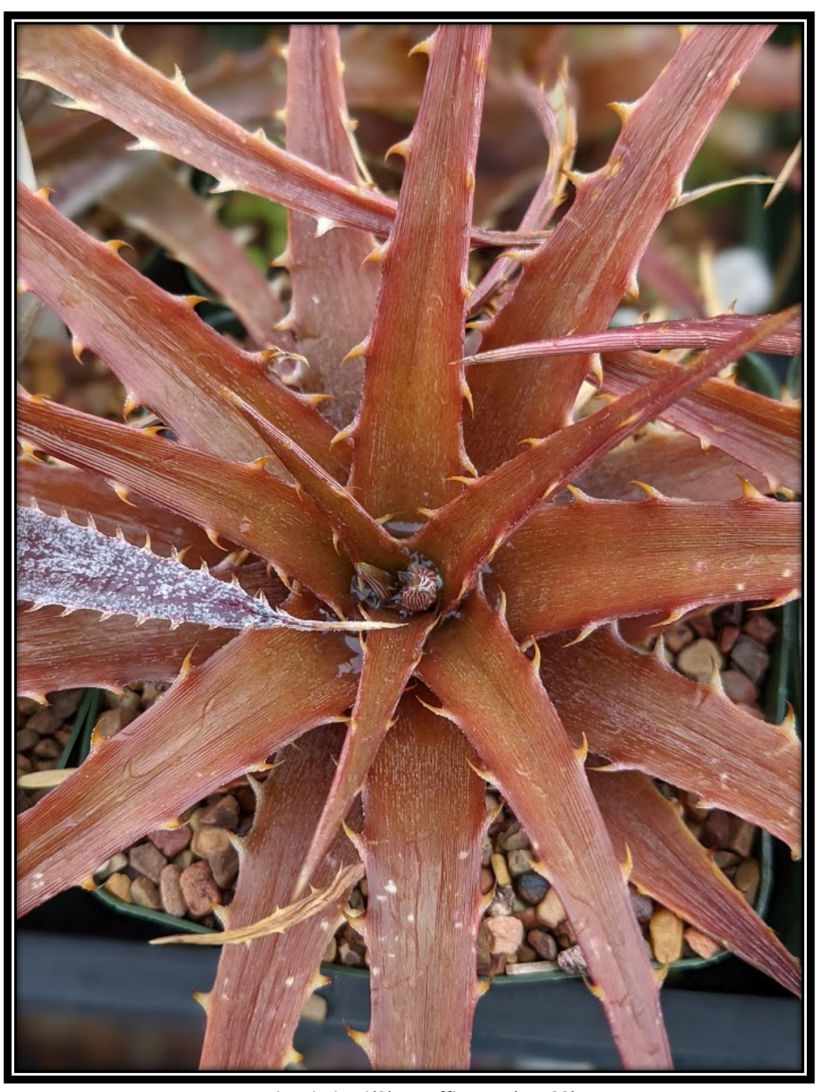
Dyckia, hybrid(?) – Raffle win (ex: ??)