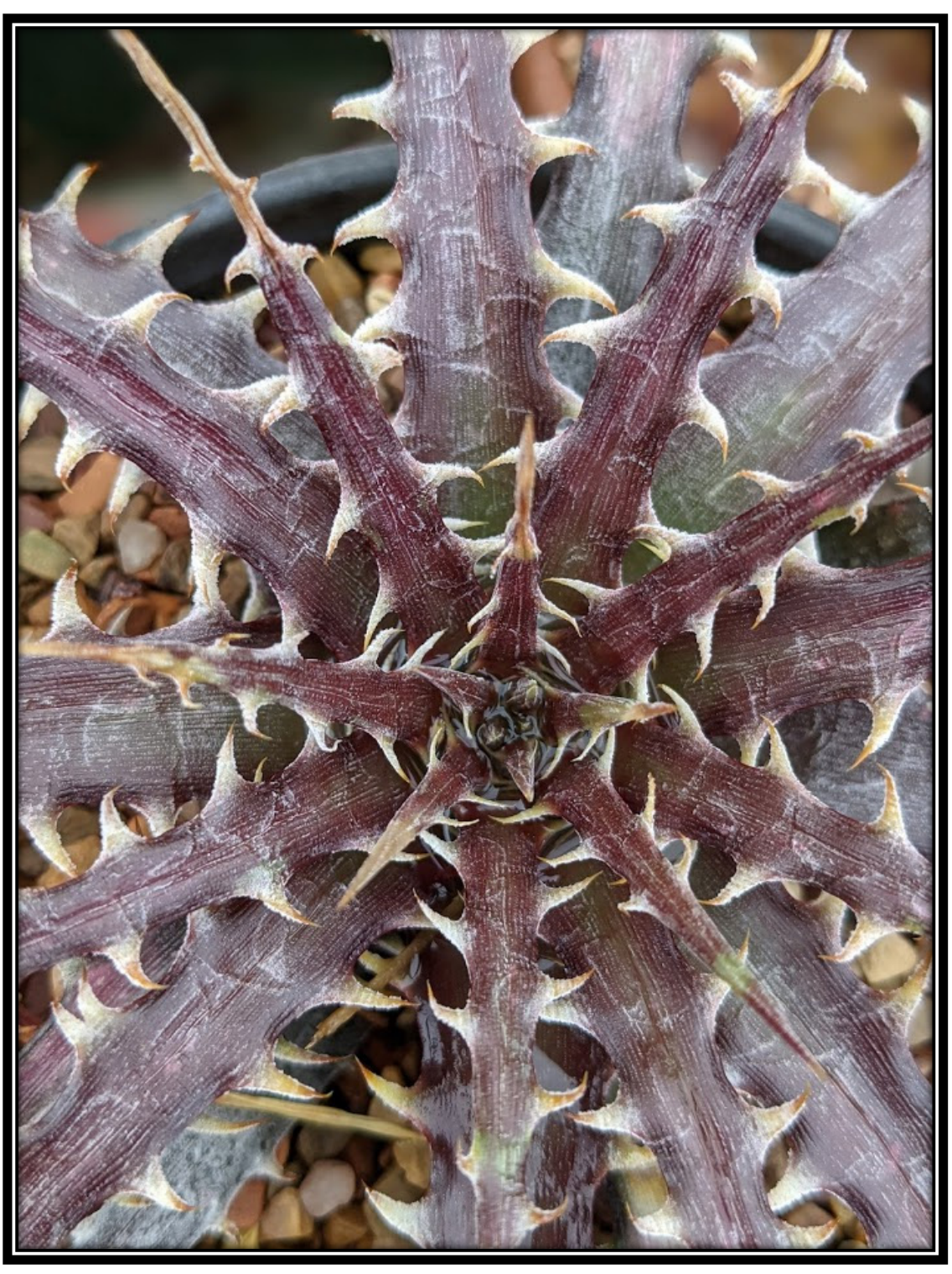
Bryan Chan Dyckia hybrid, Tracking Code 8SS