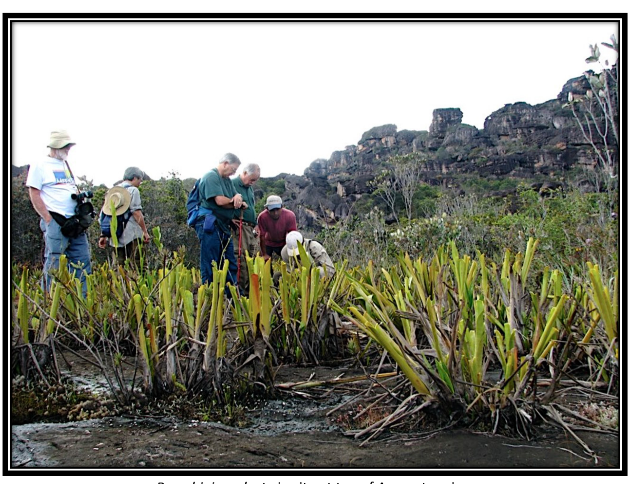
Brocchinia reducta in situ at top of Auyan-tepui