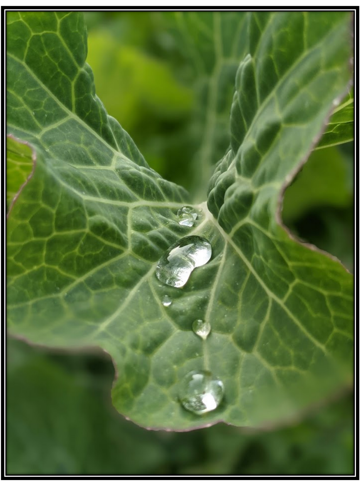
Random water droplet on "not a Bromeliad " (actually Chinese Kale)