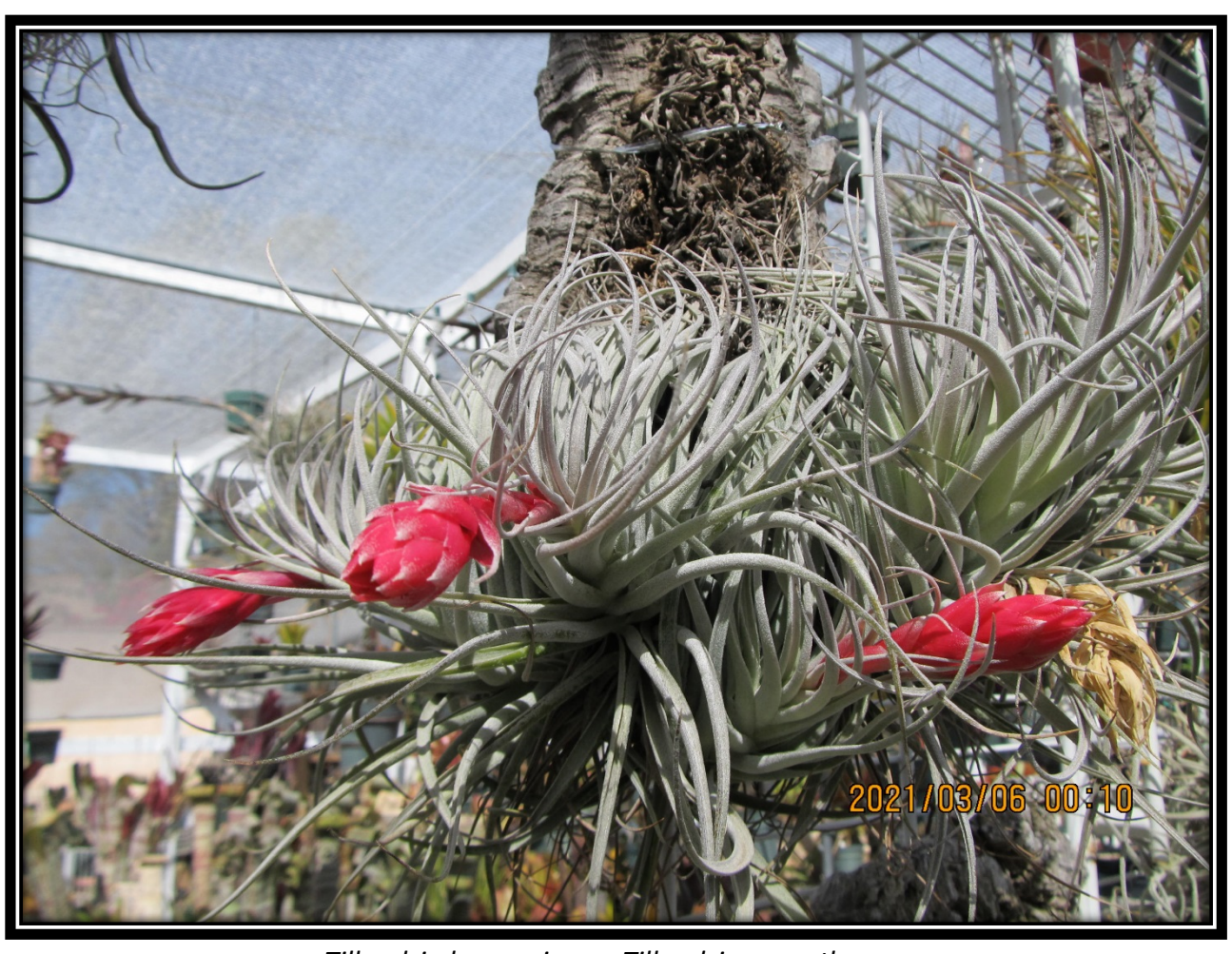
Tillandsia leomaniana x Tillandsia aeranthos