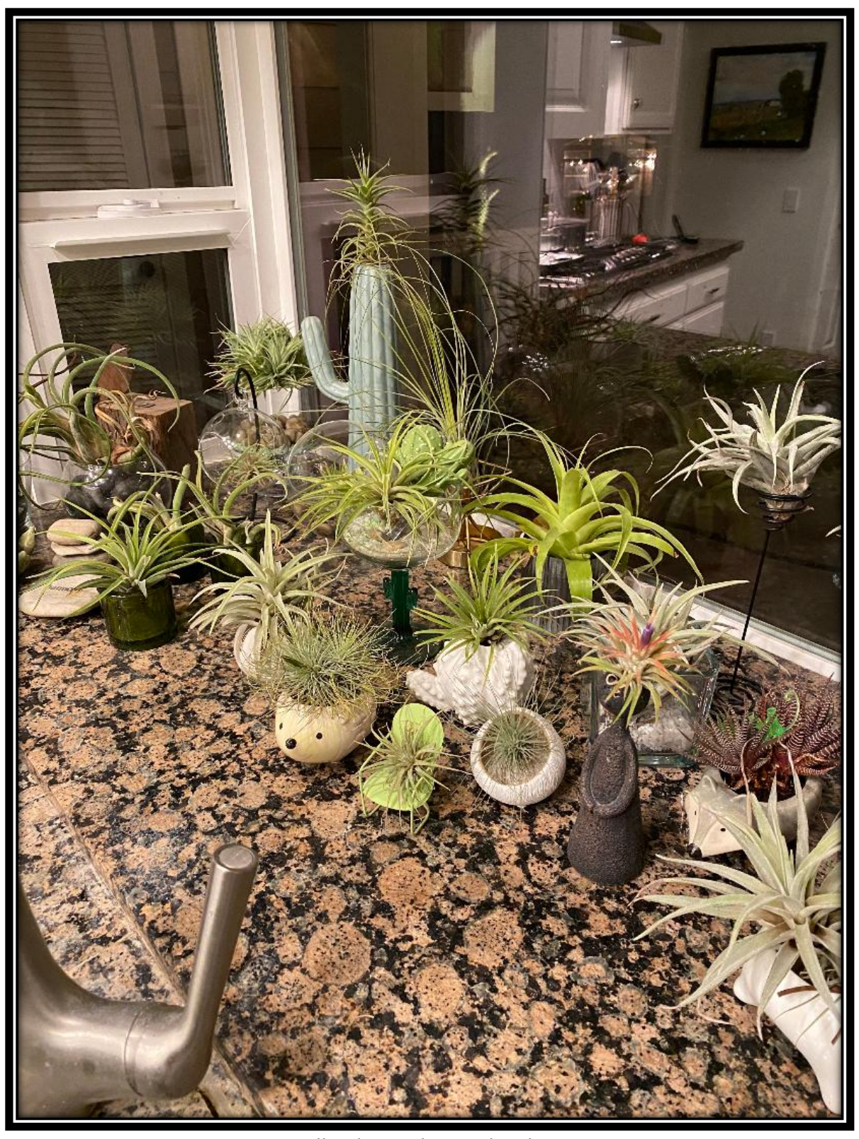
Tillandsia in the window box