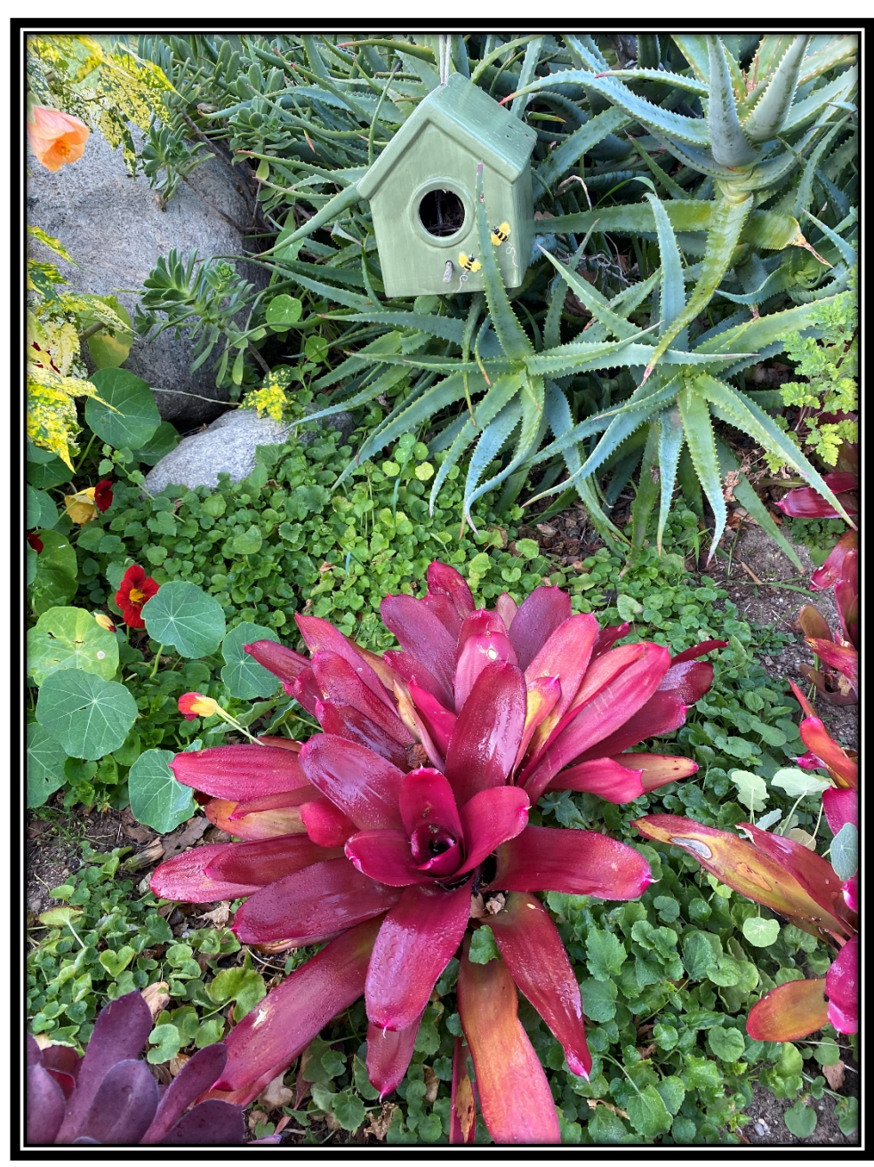
Garden 2