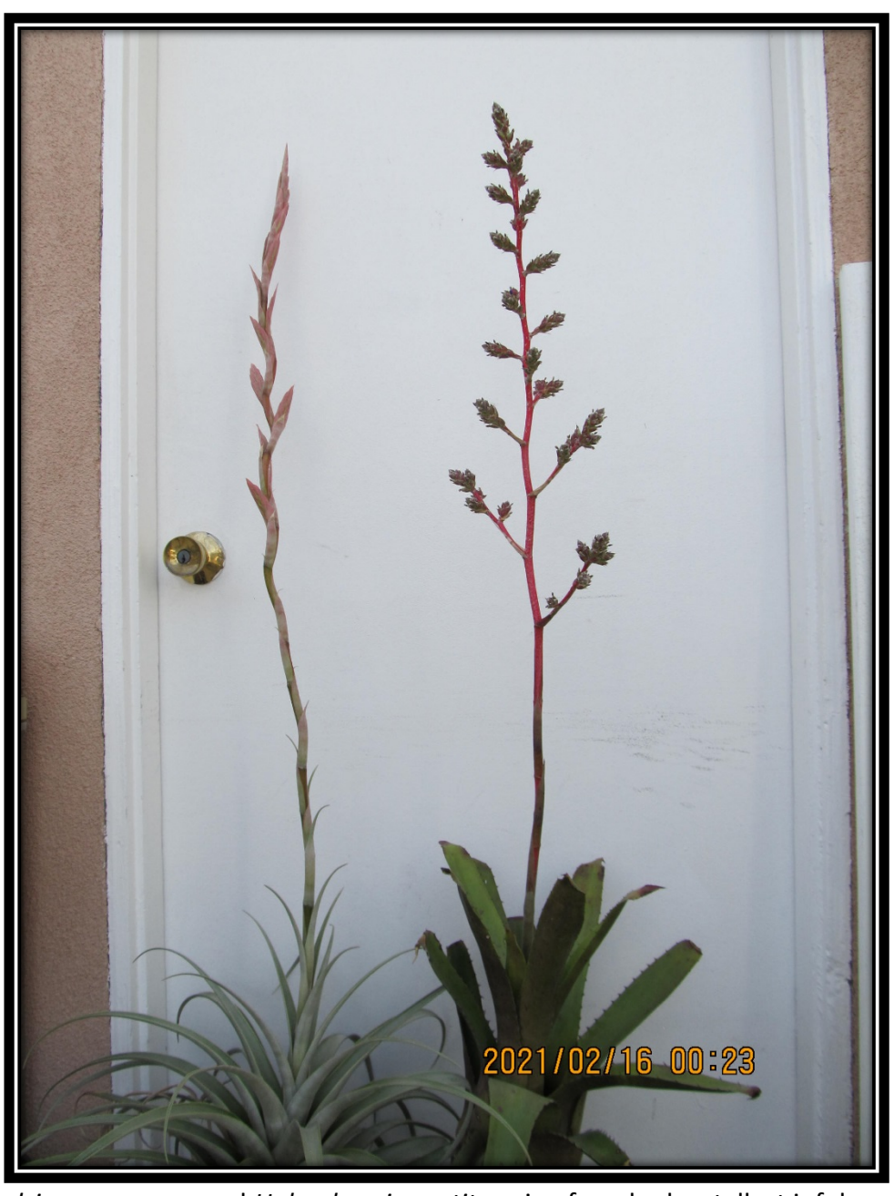
Tillandsia roseoscapa and Hohenbergia vestita vying for who has tallest infolrescence