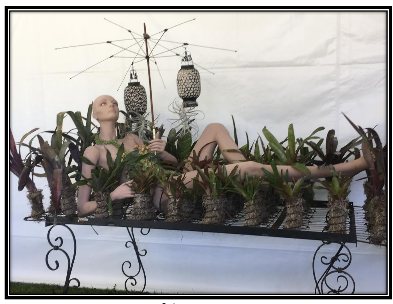
Dolores, repose Photo, and staging, courtesy of Kathleen Misko